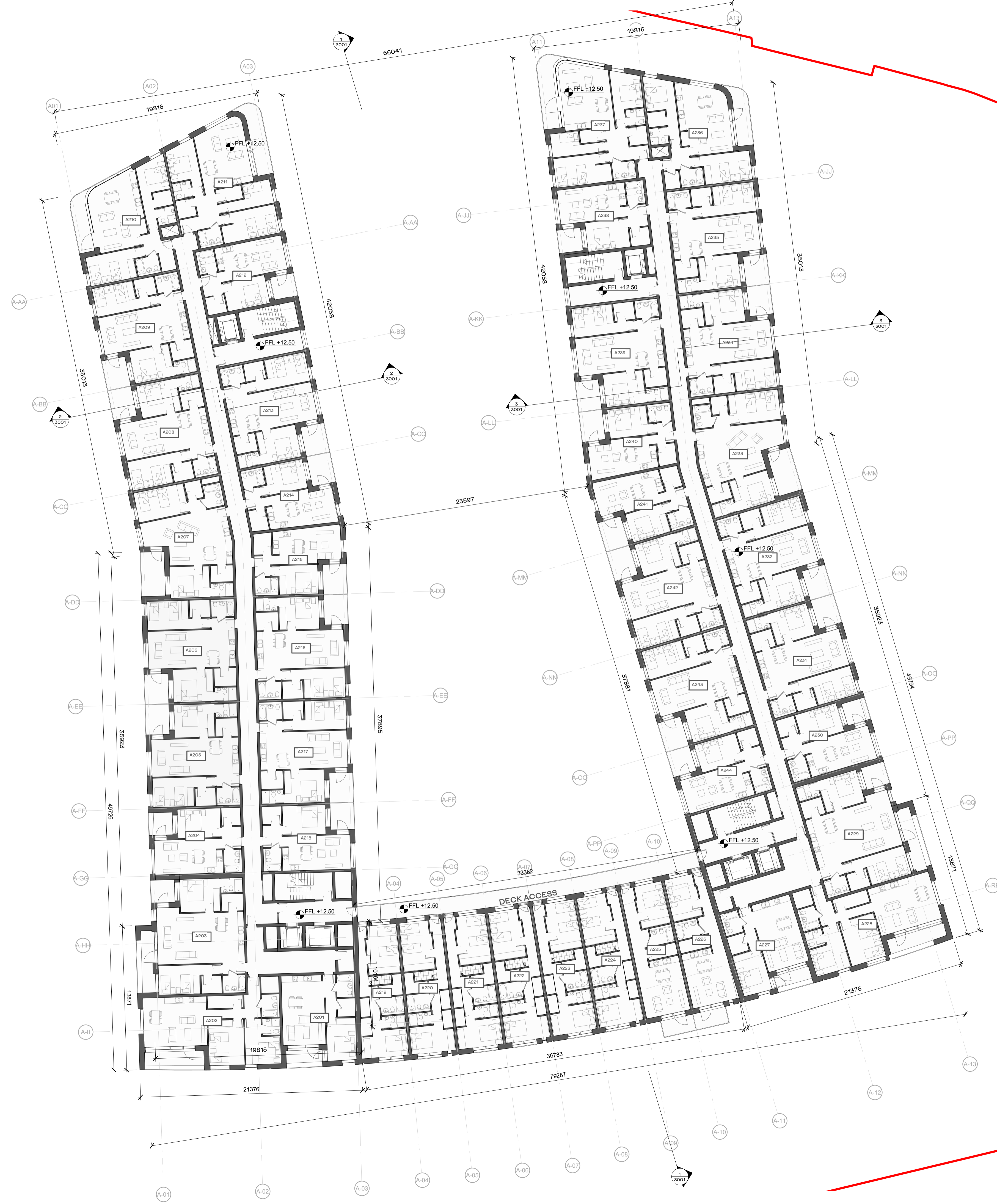
1 ZONE 01 - BLOCK A - SECOND FLOOR 1:250

Henry J Lyons Architecture + Interiors henryjlyons.com +353 1 888 3333 info@henryjlyons.com 53.54 Pearse Street Dublin D02 K466